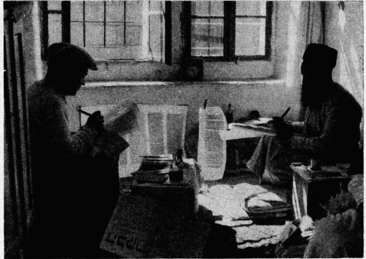
SCRIBES OF THE TORAH OR JEWISH PENTATEUCH.

and discovered in Josiah's reign as a result of the recent dilapidations. (4) Lev. 17-26 is supposed to represent another code—the Holiness Code (H)—belonging to the closing days of the kingdom of Judah and showing affinities with the last nine chapters of Ezekiel. (5) This was incorporated after the return from the Babylonian exile in a much larger document called the Priestly Code (P). P began with a summary of history from the Creation to the Exodus, and continued with the elaborate and detailed ritual prescriptions concerning the tabernacle and priesthood in Exodus, Leviticus and Numbers. The promulgation of P is associated in the Wellhausen theory with Ezra's visit to Jerusalem and his public reading of "the book of the law of Moses" recorded in Neh. 8 (444 B.C.). Soon afterwards, P was made the framework into which the other documents, JE and D in particular, were fitted so as to form the Pentateuch and the book of Joshua much as we have them now.